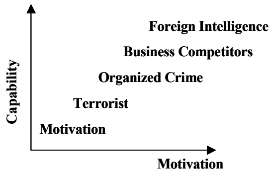
Figure 3. SEAS Classification of Offense Agents

For the purpose of this simulation, the offense agents have been modeled using genetic algorithms. The advantage of using the genetic algorithm in modeling the offense agents is the capability to dynamically change the composition of the offense agents. During each period of the experiment, successful agents are retained and recombined to generate new offense agents while the unsuccessful agents are eliminated. This reproduction of the new set of offense agents in the next generation is carried out using the selection, crossover, and mutation operations of the genetic algorithms (Goldberg 1995).